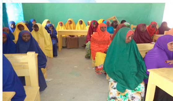
Students and their parents during partial scholarship award

in Puntland. Children from poor, orphan, Minority family background were selected and identified in joint exercise between MOE and Care to award partial scholarship in all the project schools in Karkaar, Bari and Sanaag regions. All project target schools (16) received SOMGEP partial scholarship award in their respective areas/locations however there were a lot of complain on the amount of partial scholarship award which was $ 40 per students/pupil for the academic year 2014 -15. Almost of the project target schools asked the partial scholarship beneficiaries (pupils/