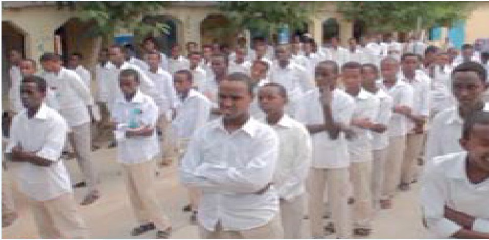
School children at morning assembly at Newawi secondary school, Bosaso

In 2014, TASS schools offered active learning environment to 9,820 students in different locations. To upgrade the capacity of the schools, 15 class rooms were furnished, 54 primary teachers were trained on curriculum implementation and class management. Then 140 students were awarded university scholarships within local universities and in Sudan.