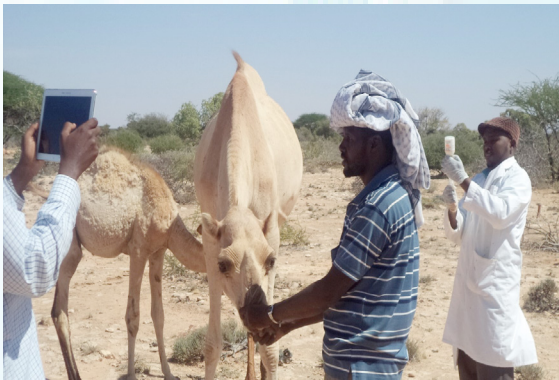
Staff prepares to inject sick camel