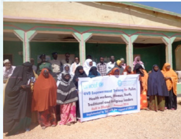
Participants in a GBV awareness meeting pose with facilitators

TASS enhanced public awareness on GBV and reached a total of 5,974 (1,581 women, 2,075 girls, 1,951 boys and 367 men) benefited from these awareness sessions given and each mobilized community nominated its GBVAG. TASS prepared and conducted GBV empowerment training for 165(77 men and 88 women) stakeholders. As commemoration days, TASS participated in various human rights commemorations namely : FGM\C Zero Tolerance Day, International Women’s day