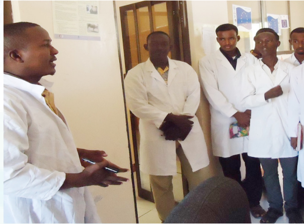
Laboratory technician at Government central lab explains nature of job

During the academic study, the second year students visited the government central laboratory in Galkayo. The head and all staff of the laboratory jubilantly welcomed the students. The students were taught the following: how to make a survey, how to collect the sample, store and manage, transport and diagnose the sample in order to establish the disease contained.