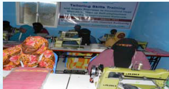
Trainees of a tailoring training course

project strengthened the capacity of both citizens and local government's district council members are accountable to citizens.