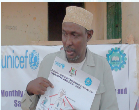
Participant using poster to show food-shit-water-food chain

In Puntland, the strategy has been endorsed by the Government and is being integrated into the National Sanitation and Hygiene Policy.