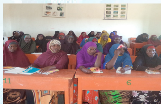
Mothers evening literacy class at project target school

Under the project output one in the project descriptions CEC cluster training activities has been done and CEC Cluster training held and conducted in all the project target schools (16) in Bari, Karkaar and Sanaag region in Puntland state of Somalia. The numbers of CECs members trained during the project implementation at the project targets schools were one hundred and twelve (112) among the trained CECs members forty - five (45) were women/female.