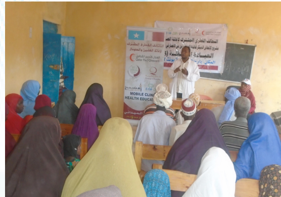
TASS staff offers health education talk

The highest percentage of patients treated suffered from urinary tract infection (UTIs) caused by consumption of untreated water. The cyclone also caused flood that filled water points used during the dry spell of the season which resulted outbreak of diarrhoea. Youth were the highest number of patients suffering and treated from skin diseases which were a result of sharing clothes and washing dozens of cloth with the same water. TASS Emergency Response Team continued to provide emergency healthcare to communities recovering from the disaster throughout the project period and completed its last operations on October 30. This paved the way for a transition to early recovery and longer-term development programs.