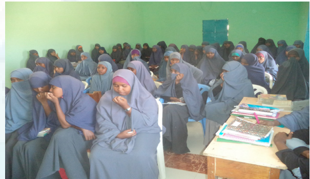
Establishment of Girls Clubs at the project target schools

the objectives and importance of establishing GC at the project target schools.