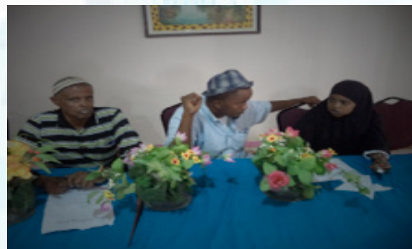
TASS staff talks to new arrivals

TASS is a member of the GBV and Child Protection Working Groups. In Galkayo, TASS implemented this project focusing on identifying new PoC. Staff were able to provide and inform the IDPs/refugees with the necessary services such as advocacy mechanisms, referral system and response to GBV and vulnerable emergency cases to service providers such as the hospitals, legal aid groups, and police/ courts services. It supported a number of cases from IDPs and refugees in Galkayo.